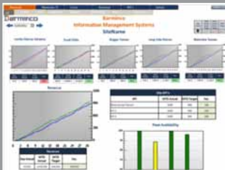
The Barminto Dashboard

Work has also commenced on a "dashboard" reporting tool which will enable our sites to evaluate their progress against agreed KPI's. The dashboard is being developed on the new version of CorVu which is due for implementation in Q3 2011.