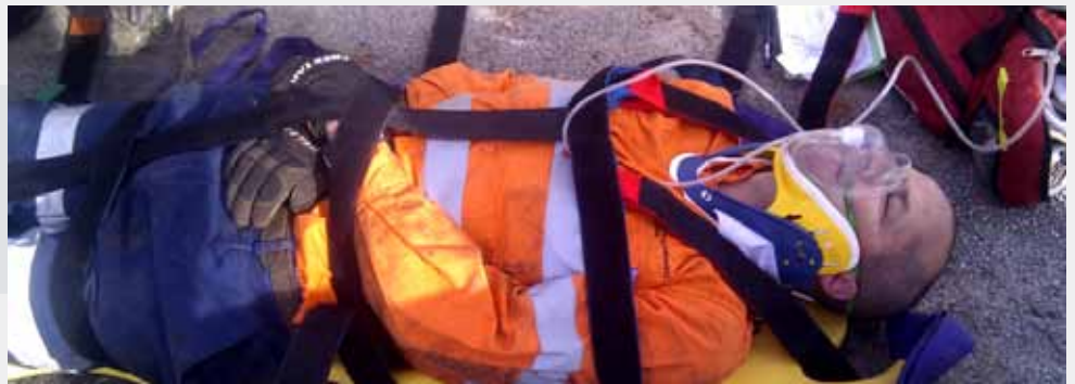
Situation stabilised ready for transport.

Guess which site the Master Chefs went to? More in September's INSITE magazine.