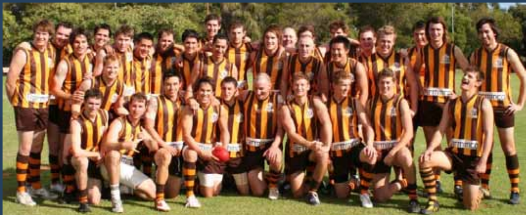
The WA School of Mines team